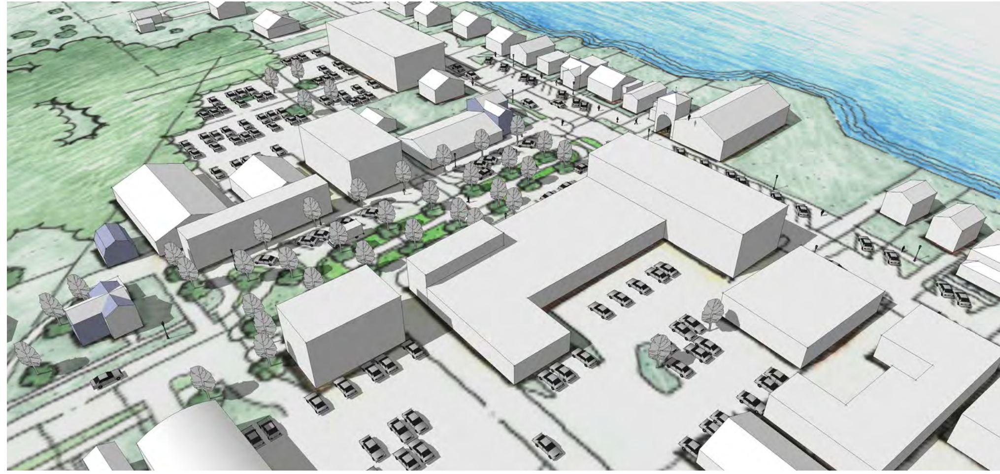
Birdseye view of downtown facing northeast from 75 Barkerv